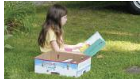
NEWS FROM THE BAKERVILLE LIBRARY, July 2008. Published by the Friends of the Bakerville Library, 6 Maple Hollow Rd., New Hartford CT 06057. (860) 482-8806.

Interested in reviewing a book for the newsletter (or the blog! www.bakervillelibrary.blogspot.com )? E-mail jauclair@snet.net , or call 482-8168.